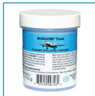
70307-L (4 oz - 113 g)