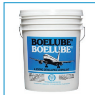
70307-05 (35 lb - 16 kg)